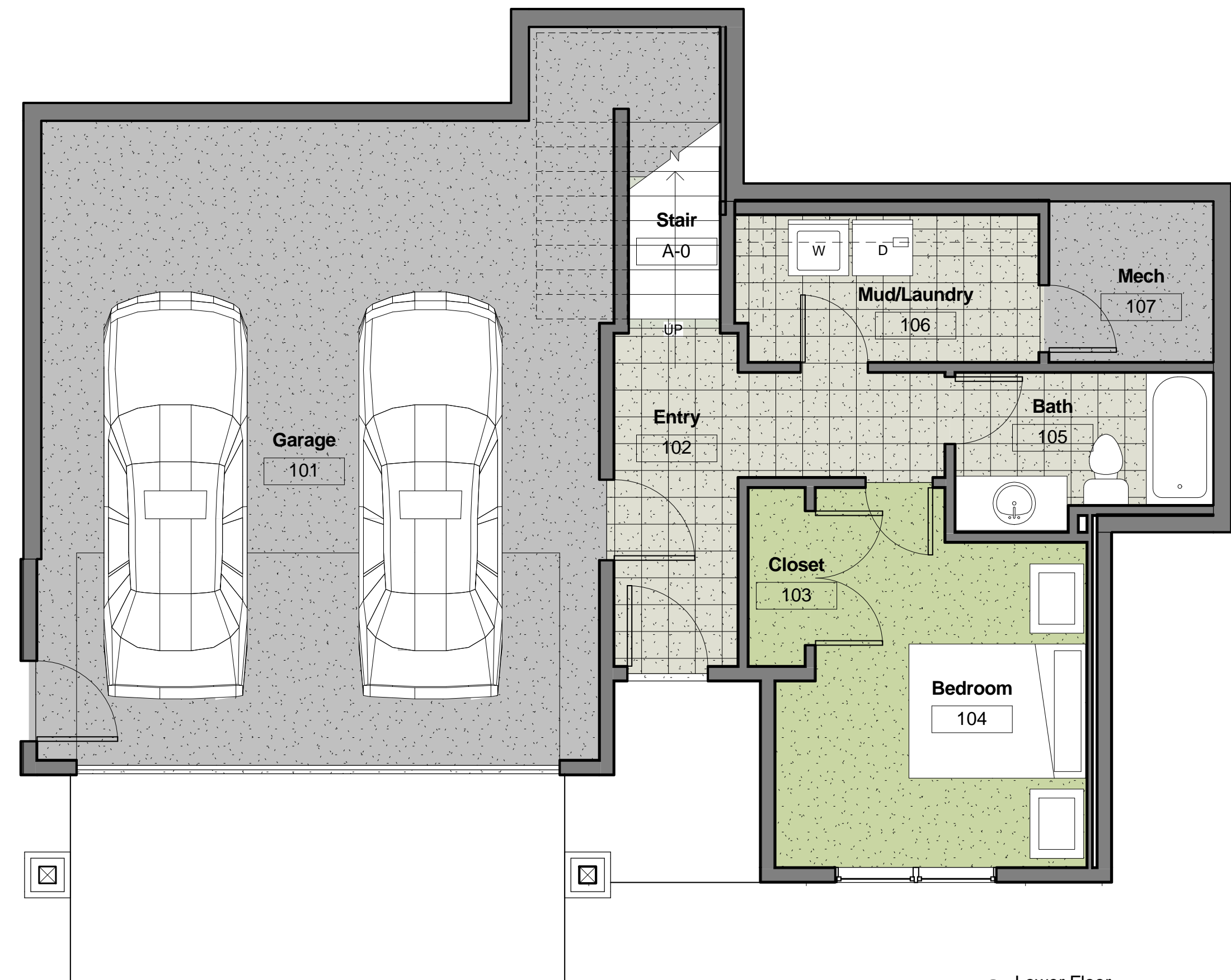
1 Lower Floor- 1/4" = 1'-0"