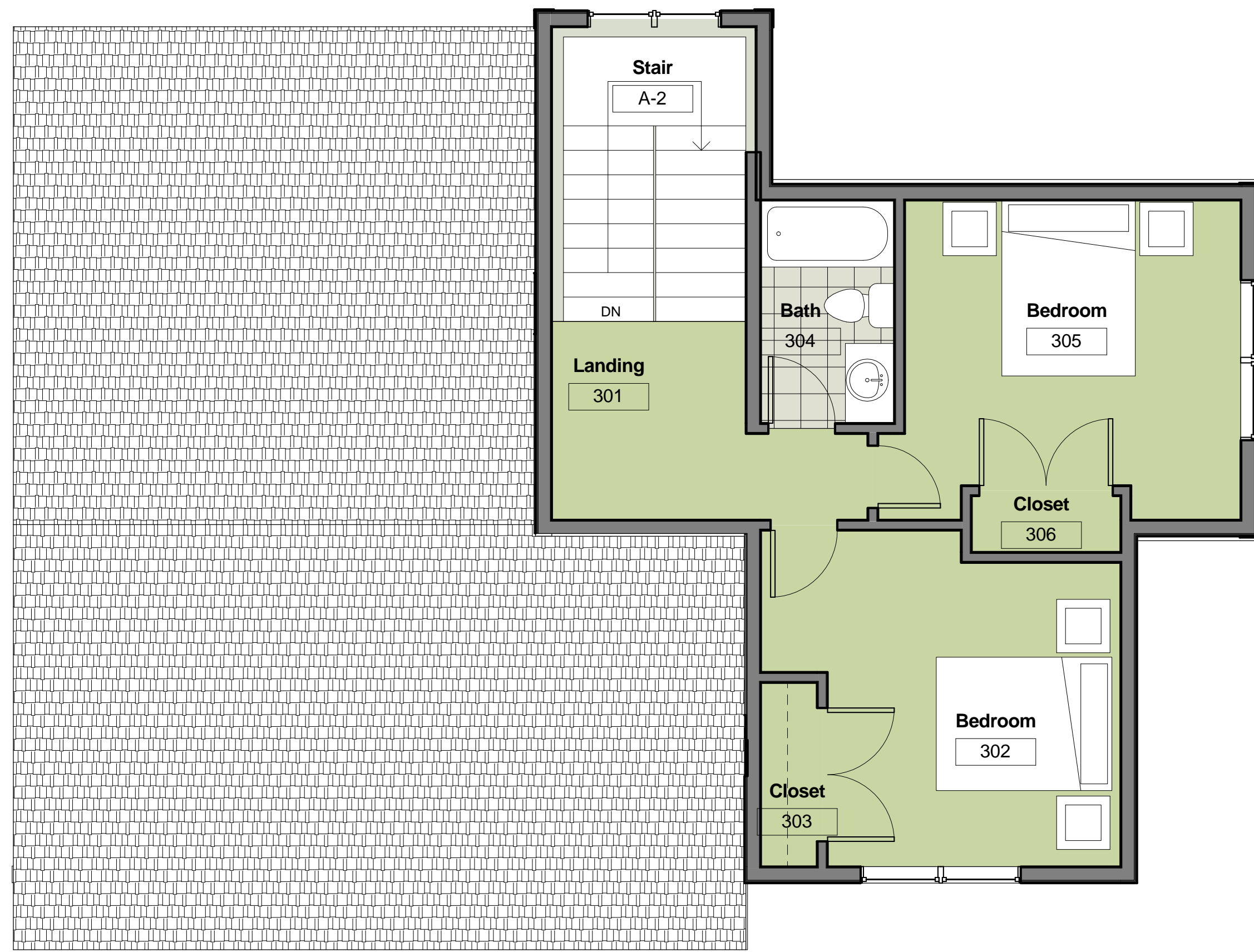
3 Upper Level- 1/4" = 1'-0"